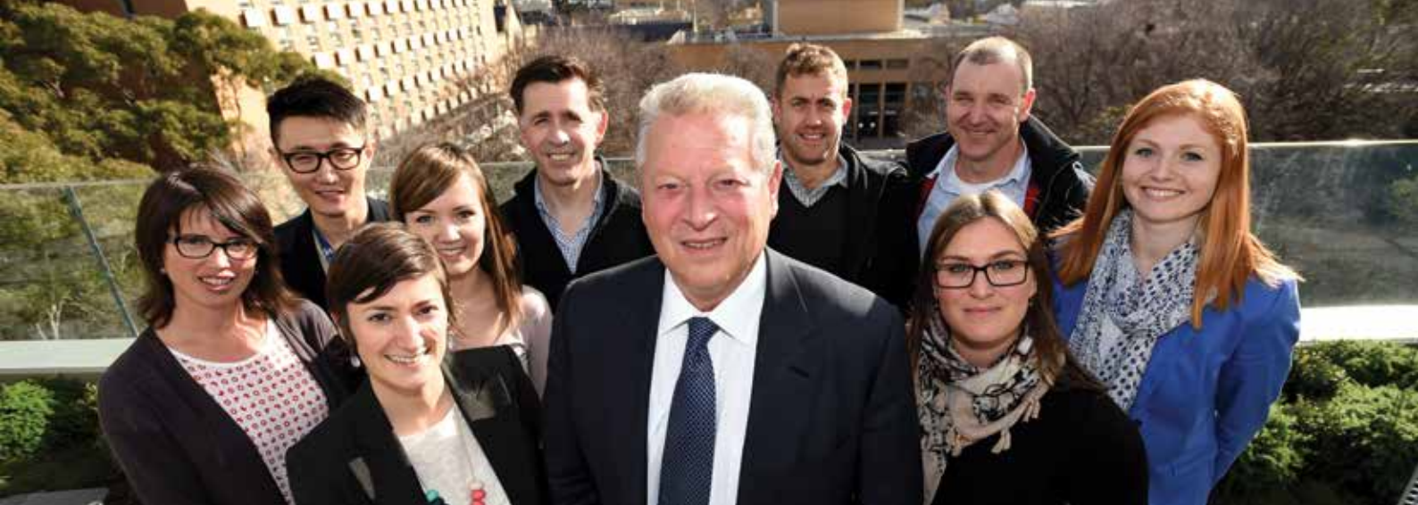
Former US Vice-President Al Gore visits the University of Melbourne, and meets PhD students from the Australian-German Climate and Energy College.