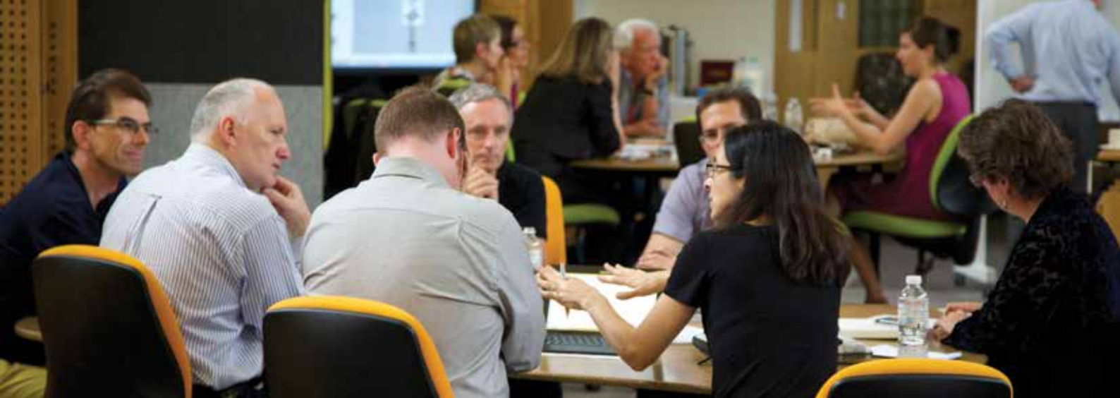
Southern Cities Research Centre