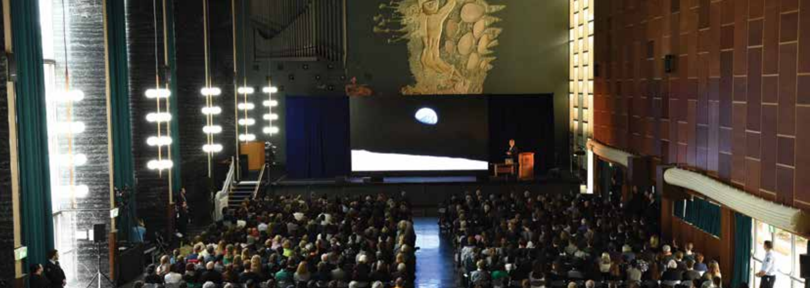
The Hon. Al Gore delivers his presentation 'The Climate Crisis and The Case For Hope' to a full house of Melbourne University staff and students.