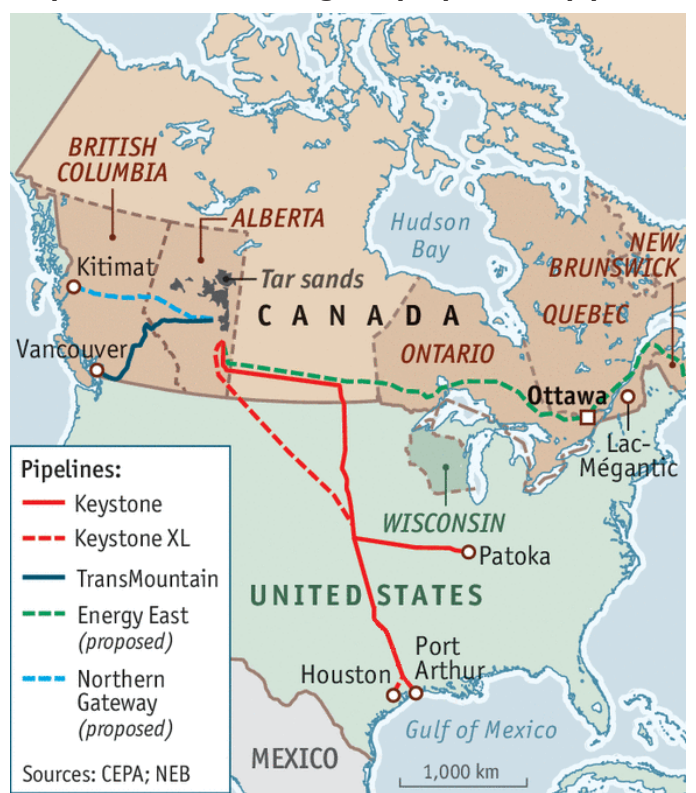
Map 1: Alberta's existing and proposed oil pipelines